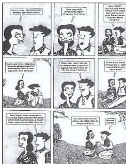
Figure 3. Selendang Siti Rugayah , 1997

Table 2 shows cartoonist Rejabhad's cartoon entitled Tan Tin Tun in 1989 which has a sociological theme. It touches on society and its conflict. It also has love and economic themes. This cartoon uses classical and traditional Malay language. The illustration uses a black and white tone. The form of the cartoon has Malay characteristics and the strokes of the drawing are fine and bold. The cartoon has a sequential frame and is arranged one by one from left to right and continues to the bottom.