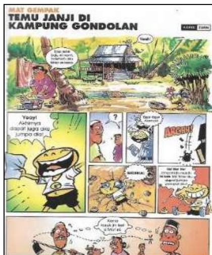
Figure 5. Mat Gempak , 1998