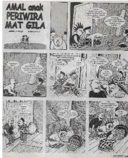
Figure 6. Amal anak Periwira Mat Gila 2001

cartoon character and the text is suitable for each frame. Humor elements of the cartoon could be seen in the form of shapes, characters' actions and expressions, content, and text delivered. The text is suitable for each character, as the text is commonly used by the people in the society symbolically, sarcastically, or humorously.