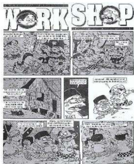
Figure 4. Workshop 1996

Table 3 shows the theme in the artwork, which is about the love conflict between Rugayah and Sulaiman, sociological, cultural, economic, and religious. Sociological refers to social life in the village that practices Malay customs and lifestyle. In the 1990s, Rejabhad began to produce another cartoon entitled Selendang Siti Rugayah . His style of drawing is classic. The language used describes him as a classic cartoonist as he uses full spelling and polite prose. He is gifted in painting especially in the background of the cartoon where he shows the environment of a village. He draws the background carefully by using thick and small lines. Humor can be seen in the cartoon from the distortion of characters, the text presented, and the action of characters. Besides, the humor of the cartoon is presented in the lesson and satire forms.