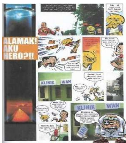
Figure 8. Mat Gempak, 2000

Table 7 shows the representation of the Malaysian community where there are various ethnicities in a village. The community, social, and cultural themes in this cartoon can be seen in the images drawn. There are a variety of communities such as Malay, Chinese, Indian, and others. Sukun portrays common events that happen in a community such as the attitude of a young man who likes to owe money but has problems paying his debts. The images are drawn in detail. The first frame only shows one frame but has all community, action, caricature, and landscape. Sukun sarcastically presents this episode but still inserts the element of humor through the style of the characters in the cartoon. He highlights various facial impressions and actions to create the element of humor in the story. The cartoon is funny and has a satire element. The facial impression and action presented are funny including the text of the dialogue.