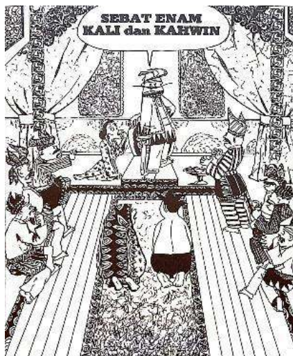
Figure 1. Periwira Mat Gila , 1988