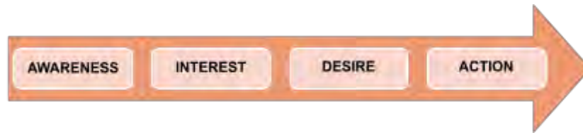
Figure 1. AIDA model