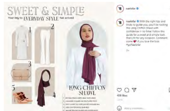
Figure 4. Creative Advertising Post by Naelofar Hijab Brand

Brand advertisements on Instagram Naelofar Hijab are evaluated using the AIDA model. This strategy is applied to the Naelofar Hijab Brand to examine ten successful campaigns utilizing an Instagram marketing tool to drive audience traffic to the brand effectively. The AIDA Model, which is hierarchical, explains how Instagram followers are directed toward making purchases related to the Brand's interest. The AIDA model, which is order-based, depicts how Instagram followers make purchases from a business. As a result, the process increases followers' contact with the Brand and elicits emotions, resulting in a more fulfilling and enjoyable brand experience. The experience may result in creating a new target audience based on feedback.