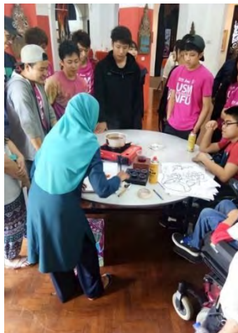
Figure 2. 'Batik' demonstration at MGTF-USM

The Asian Art Museum is the first university museum in Malaysia to offer services for students and the public regardless of race and religion where artefacts can be accessed for learning purposes (Wiessala, 2017). This prestigious university is also the only one in Malaysia that has a museum that exhibits artefacts consisting of three main civilizations of the World-Malay/Islamic society, China and India on display (Insight Guides, 2017). On the other hand, in Penang, Tuanku Fauziah Museum & Gallery (MGTF-USM) is the only museum in the region that combines both science-technology and art-culture under one roof (Tan Li-Jen, 2012). The visiting experience at MGTF-USM provides holistic and stimulating principles of teaching and learning. Various programme involving the interaction between visitors and the museum staff, as well as the hands-on experience are very helpful to better understand the collections available at the museum.