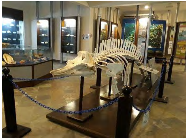
Figure 3. Collection of artefacts at the Aquarium and Marine Museum, Universiti Malaysia Sabah

Currently, both museums in the Universiti Malaya and Universiti Sains Malaysia are the most prominent, not only in the country, but also in Asia and other countries around the world. Almost every university museum and gallery in Malaysia plays a role as a centre for the collection, preservation, conservation, research, documentation, and exhibition of the country's cultural and scientific heritage. Besides that, most of the university museums and galleries in this country also offer great collections in an interesting and comfortable setting for the public to visit. For example, the Malay Heritage Museum (UPM) has several interesting collections including manuscripts, textiles, Malay weapons and many more. According to its curator, Nur Layla Witra Mat Arop (personal interview, April 5, 2020) visitors to this museum can also view and appreciate the 100-year-old traditional Malay houses representing various states in Malaysia.