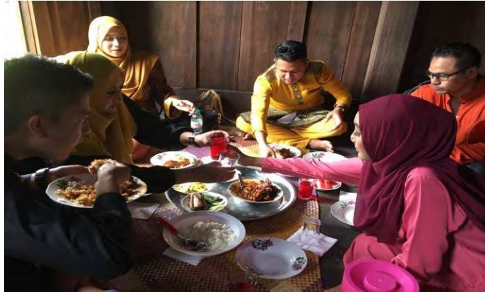
Figure 8. Unique services and activities provided at the Malay Heritage Museum, UPM

Thus, with a wide variety of exhibits and artifacts in the university museum, audiences can obtain new experiences and make their own meanings where, varieties of insightful ideas and perspectives can be created if perfect accompaniment and innovative thinking are applied to the participants. When the university museums are involved in social welfare program using educational materials linking to museums, each student will be able to develop innovative and creative thinking skills and relate to real-world abilities. Public projects and exhibitions are of great benefit to students in enhancing their skills, knowledge and acquiring new experiences related to specific interests such as culture, visual arts, professional sector and many more.