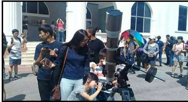
Figure 4. Visitors witnessing and observing a partial solar eclipse at MGTF, Universiti Sains Malaysia

experience enriched by science knowledge and appreciation of cultural arts and heritage in interactive, interesting with edutainment features.