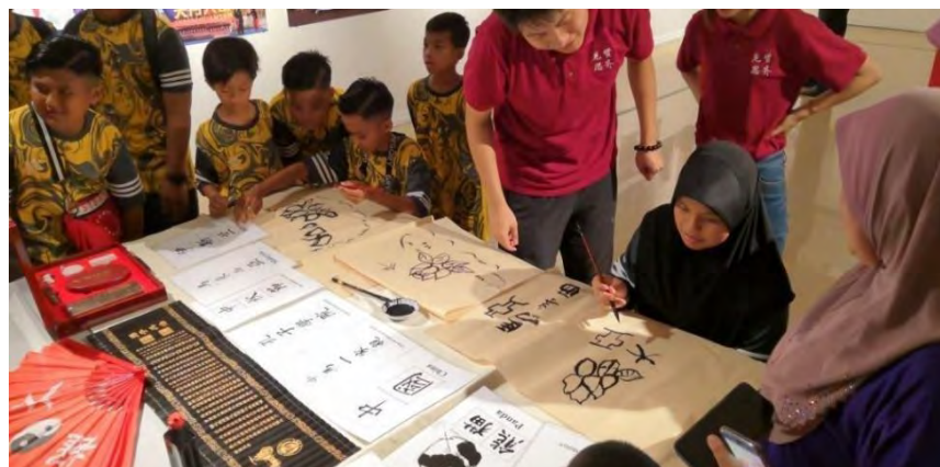
Figure 6. Activities for the development of skills by children at the Asian Art Museum, UM

When students visit the museum or bring some artifacts to the classroom for field work, the typical educational environments are instantly changing. This allows teachers and students to have the ability to engage in different settings with art objects.