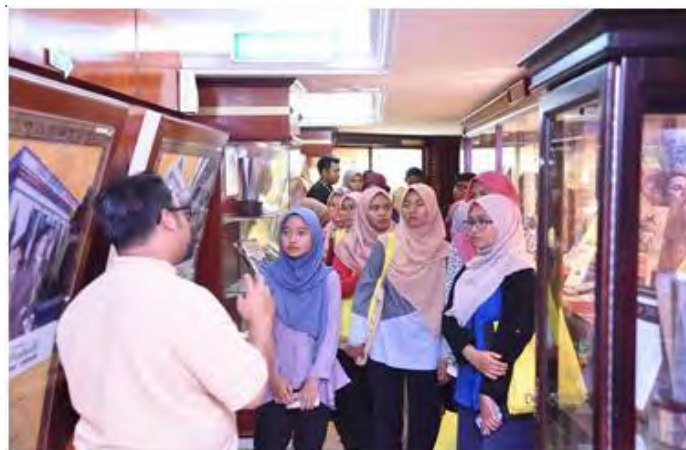
Figure 7. A brief briefing session on the exhibition at the Academic Heritage Museum, UKM by the staff to stimulate the minds of the visitors

Apart from developing skills, university museums in Malaysia play a role in enhancing one's skills and developing new concepts that can be implicit in life. Students are encouraged to experiment with their ideologies and understandings by applying critical, innovative and able-to-form critical out-of-the-box thinking. Therefore, these museums have their own distinctive characteristics, which provide audiences with a variety of informal learning opportunities. Several university museums are not open to the public due to several factors. Nevertheless, these museums still receive many visitors every month and get excellent feedback from students who agreed that they have learned new things after visiting these museums (Museos, 2018).