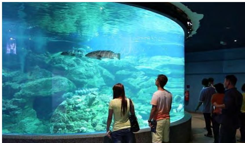
Figure 5. Learning experience by visitors at the Aquarium and Marine Museum, Universiti Malaysia Sabah