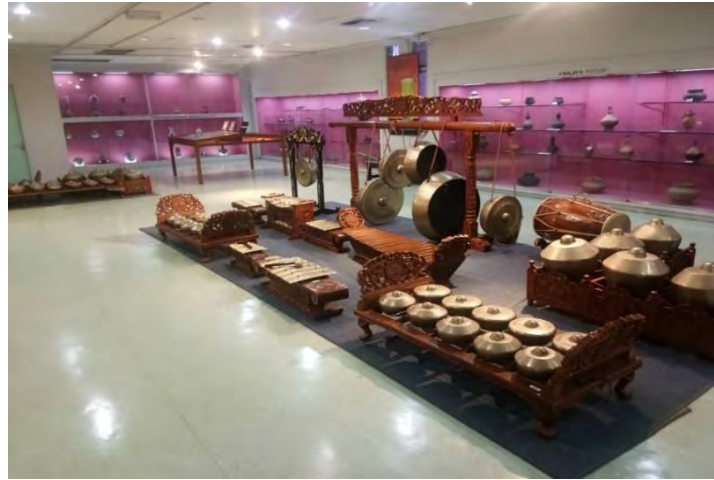
Figure 1. 'Gamelan' musical instrument collection at Asian Art Museum, Universiti Malaya

Civilisation (UIA). The collections exhibited in most Malaysian university museums are spectacular and have high historical significance.