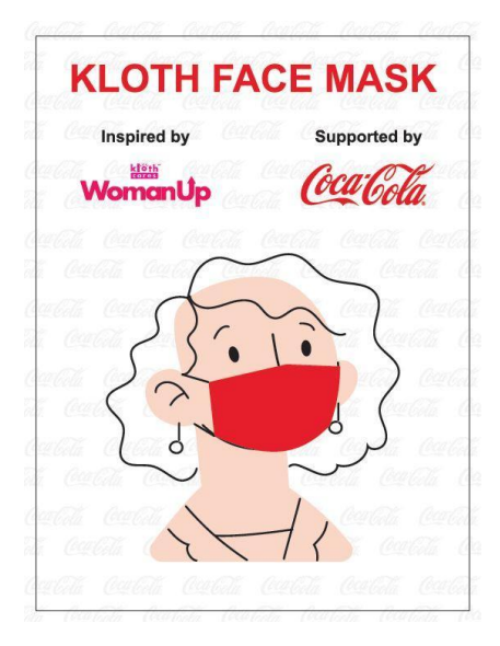
Figure 1. Kloth Face Mask in collaboration with Coca-Cola

Description : The main element seen in this poster is the line forming a woman's face shape. The shape of the earing hanging and the form of women's hair is more clarity of feminism. The red face mask gives another vital element to this poster. Two logos were placed parallels at the top of the visual, and the typography of KLOTH FACE MASK has the most prominent font among all visuals. The background of this poster places a minimal optical clarity of the Coca-Cola on top of the white space.